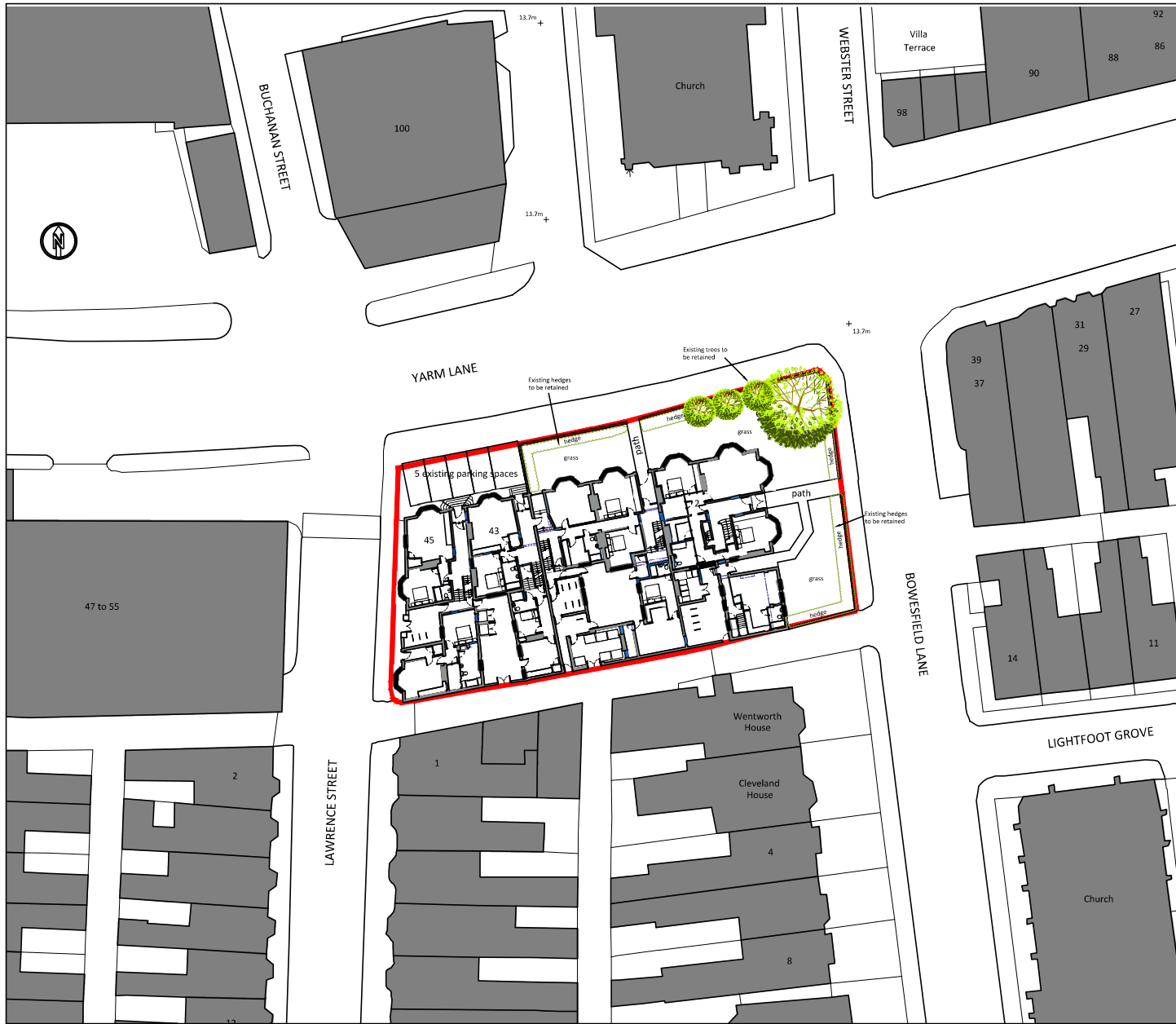
SITE BLOCK PLAN